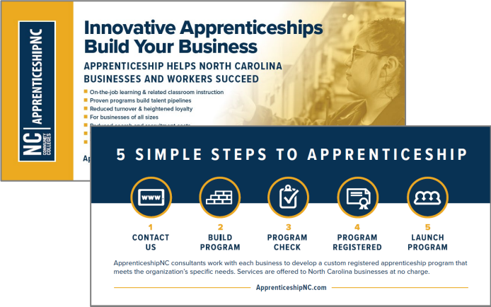
Various Rack Cards