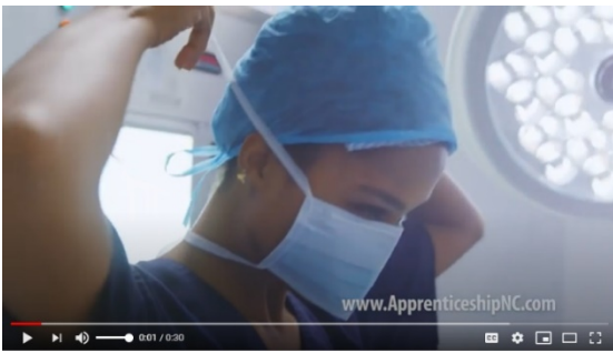
Healthcare :30 video: https://youtu.be/Lxo0hHVXe9U