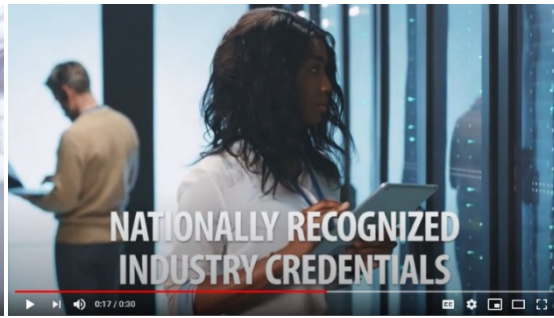
IT :30 video: https://youtu.be/n03UeMg6icw